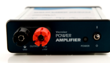
The front of the Power Amplifier, showing the output terminals, the Power Indicator LED, and the On/Off Switch