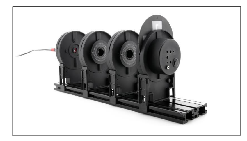
Basic assembly with Light Sensor

You are seeing a qualitative demonstration of Malus's law, with a cosine-squared dependence on the angle between the polarizer and analyzer.