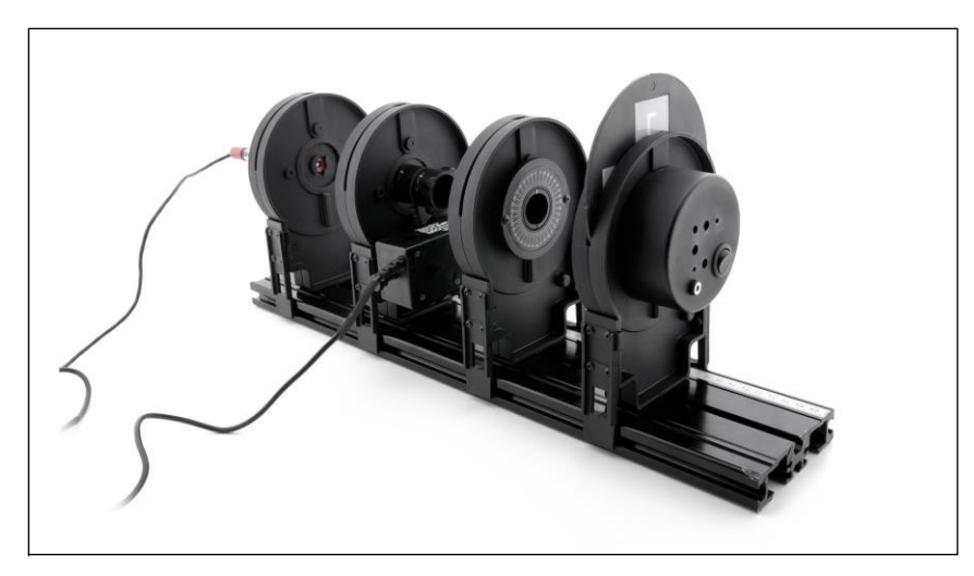
Modified assembly with the Adjustable Analyzer for Rotary Motion Sensor and a Light Sensor

Malus's law can also be demonstrated using the Rotary Motion Sensor to read the angle data. Follow the same setup described above for manual data collection except replace the analyzer with the Adjustable Analyzer for Rotary Motion Sensor, as shown below.