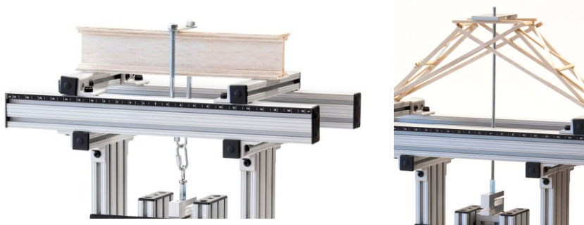
The beam on the left is secured using a U-bolt and quick links while the structure to the right is secured using a threaded rod attached to a metal loading plate.

Once the structure or beam is secured in place with the appropriate tackle, connect the VSMT Force and VSMT Displacement Sensors to an interface. Open the appropriate experiment file if using Logger Pro . Zero the sensors and start data collection. Turn the displacement wheel in the direction of the arrows (counter clockwise) and the Force Sensor travels down, applying a force to the structure or beam via the tackle. The VSMT Force Sensor registers the force while the VSMT Displacement Sensor tracks how far the structure has been deflected, bent, or stretched.