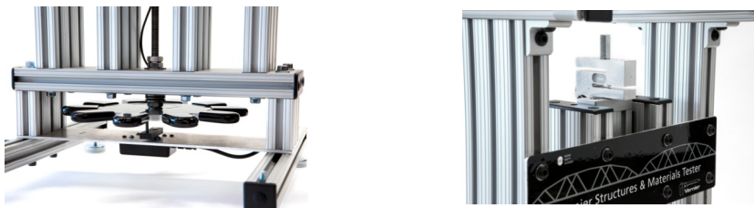
The VSMT Displacement Sensor is mounted below the wheel. Turning the wheel pulls the Force Sensor down, applying a force to the structure above.

Once the structure or beam is secured in place with the appropriate tackle, connect the VSMT Force and VSMT Displacement Sensors to an interface. Open the appropriate experiment file if using Logger Pro . Zero the sensors and start data collection. Turn the displacement wheel in the direction of the arrows (counter clockwise) and the Force Sensor travels down, applying a force to the structure or beam via the tackle. The VSMT Force Sensor registers the force while the VSMT Displacement Sensor tracks how far the structure has been deflected, bent, or stretched.