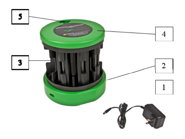
Power Supply & Storage Unit