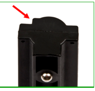
End of tube -back view