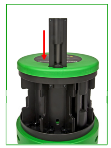
Inserting a tube