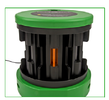
Tube at energizing station

To remove a tube, rotate the carousel until the tube to be removed aligns with the tube insertion aperture. The tube can then be removed by placing a finger under the top ledge of the illuminated area and lifting the unit until its top can be grasped from above and lifted out (see picture). CAUTION: Always allow a hot tube to cool before removing it, because of the danger of burns.