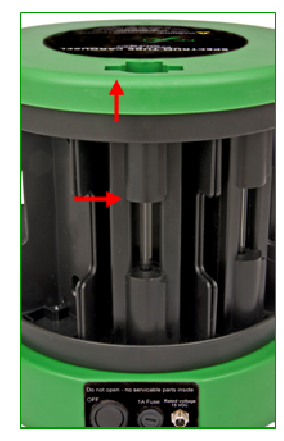
Removing a tube