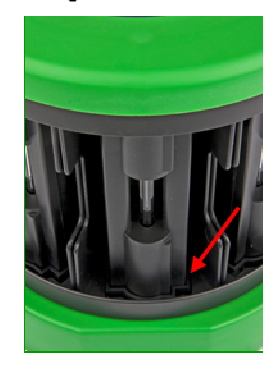
Tube in place